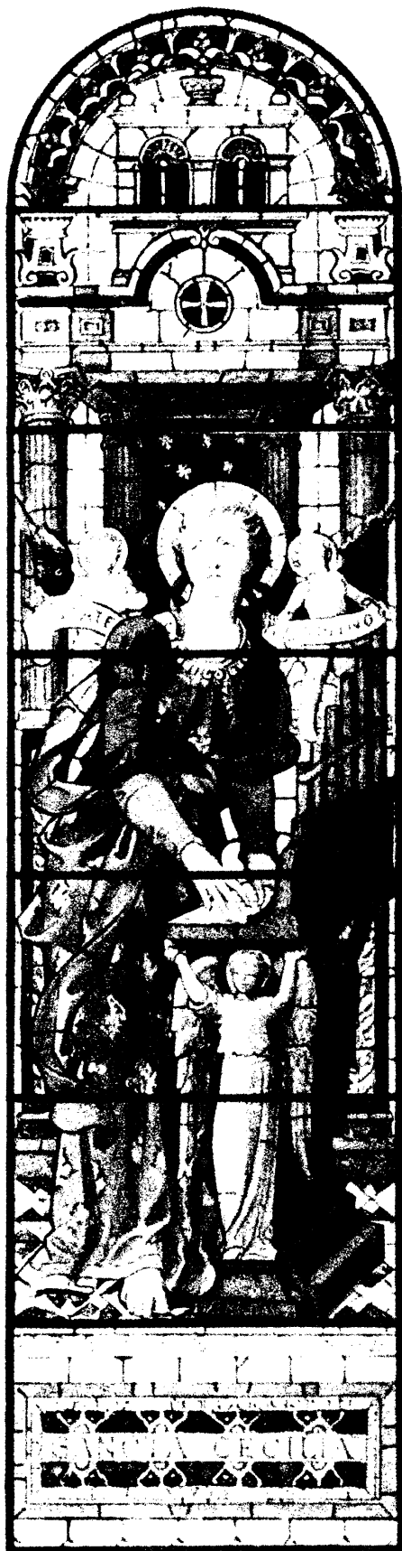
The St. Cecilia window in St. Paul's Cathedral