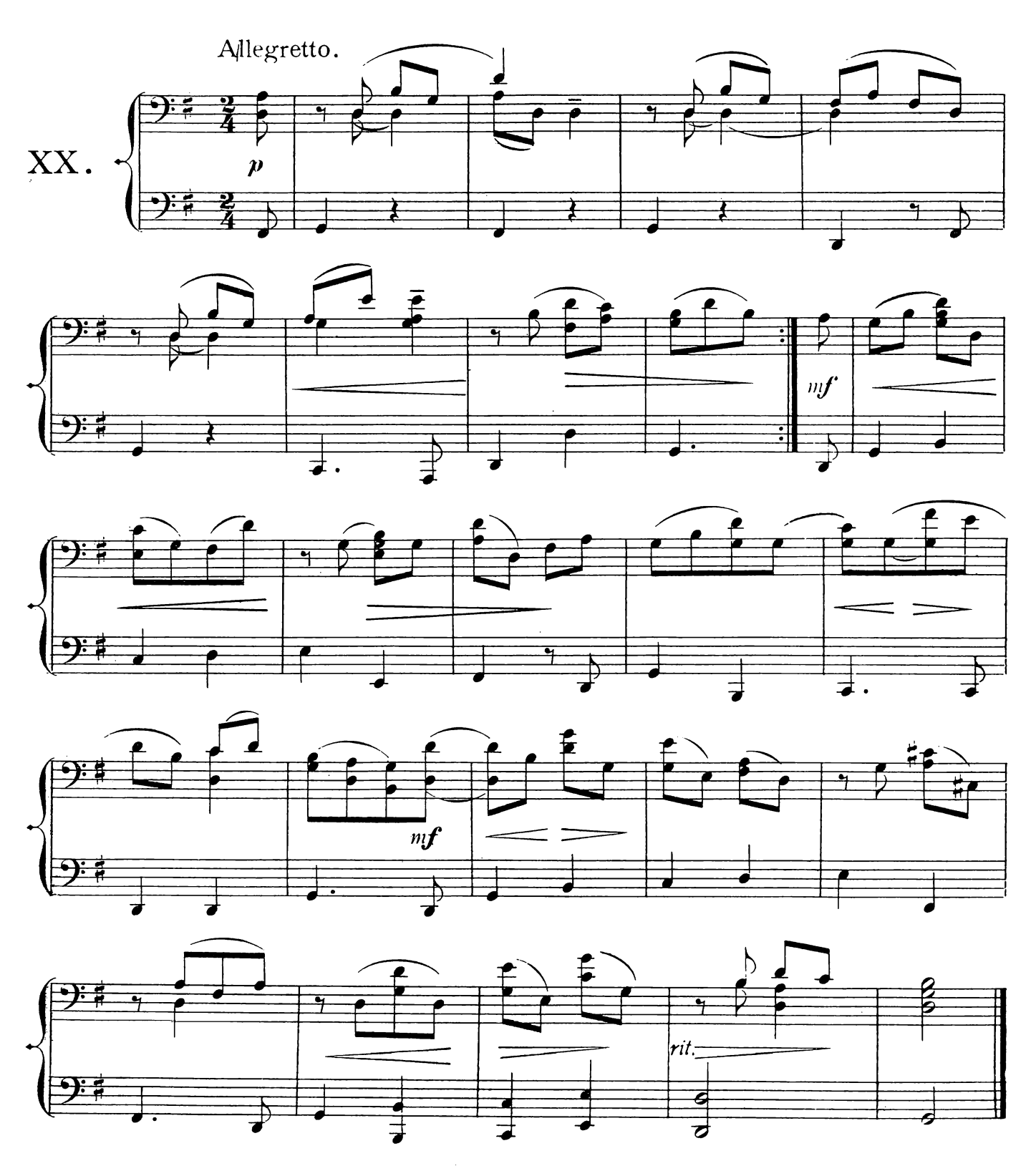
S. L. W. 2389