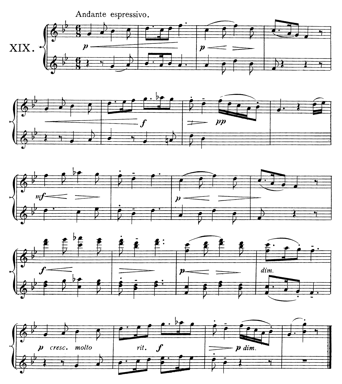
S. L. W. 2389