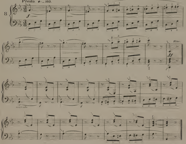
1510 - 1