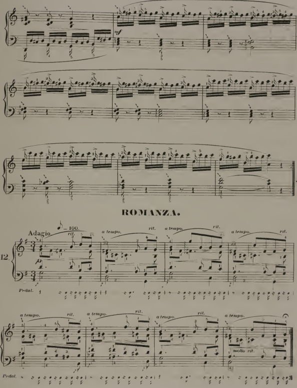
1519 - 1: