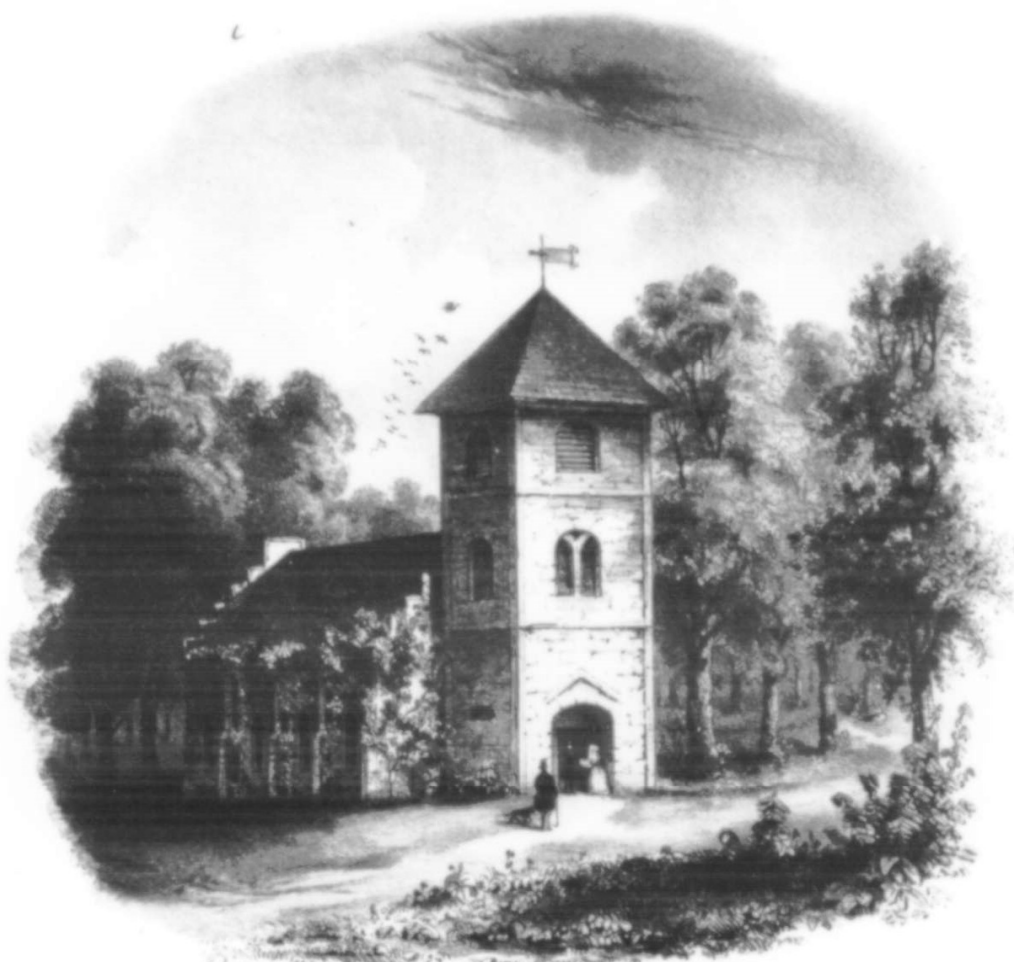
Defau's This Church near Smithfield, Isle of Wight Co. Va. built in the reign of Charles I st between the years 1620 & 1622.