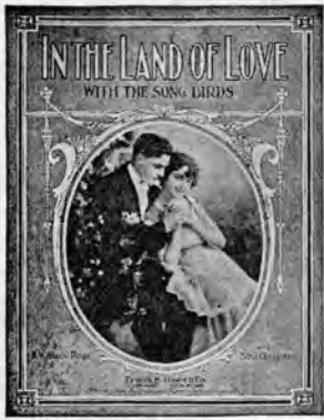
With Bird Obligato