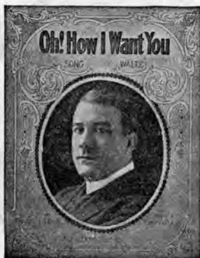
Great Waltz Ballad