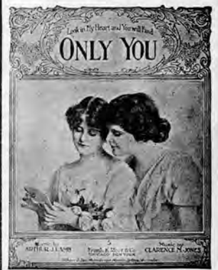
Waltz Song Hit