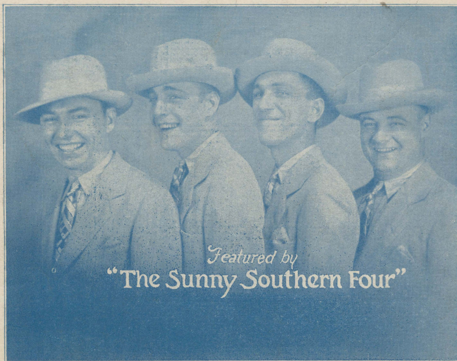
Featured by "The Sunny Southern Four"